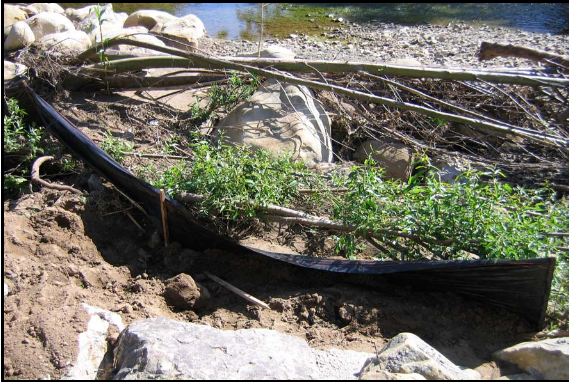
Exclusion Barrier/Sedimentation Fencing installed at bottom of bank.