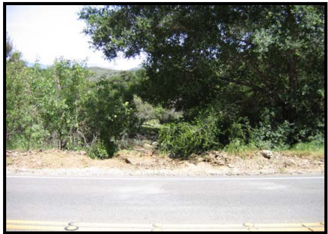
(left) First access point, looking toward Creek Road. (right) First access point from Creek Road.