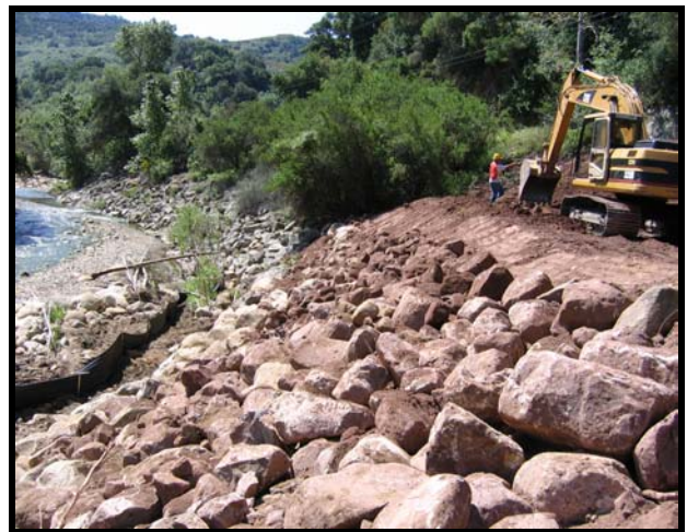
Completed rip-rap bank.