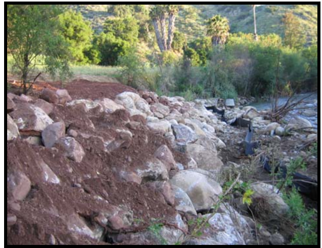
(left) Building rip-rap. (right) Filling rip-rap with soil to facilitate re-vegetation.