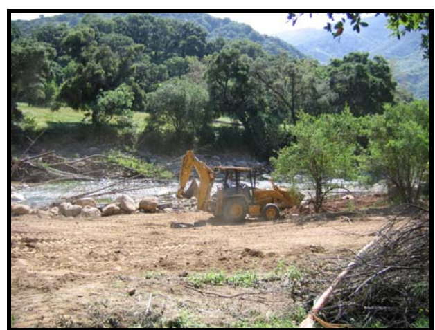
Introduced material used to bring site to grade.