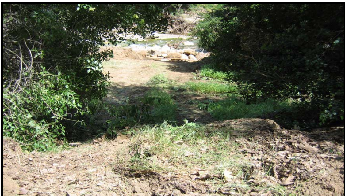
First access point from Creek Road