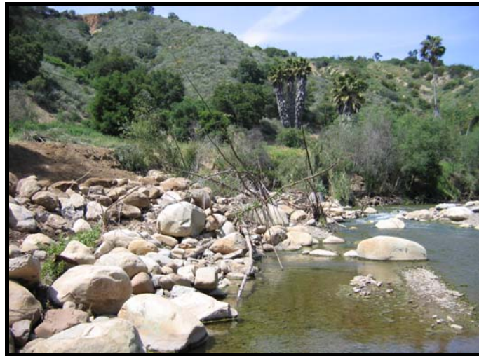
Existing boulders onsite used for riprap.