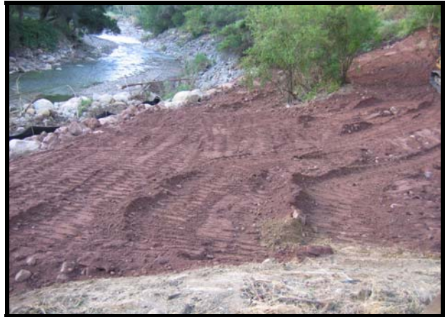
Spreading introduced material to level site.