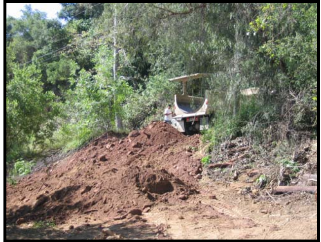
(left) Second access point. (right) Second access point, used to import foreign material.