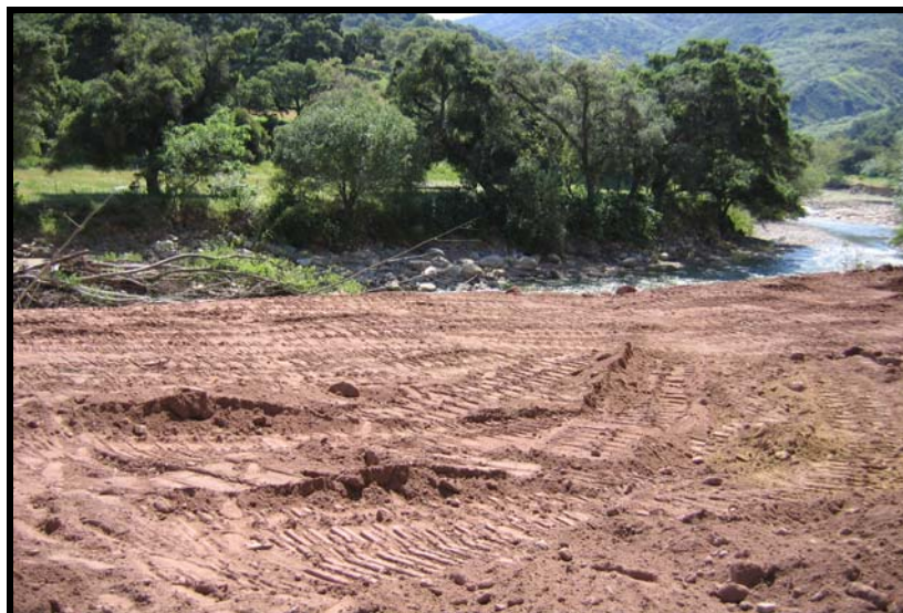
Project site at grade