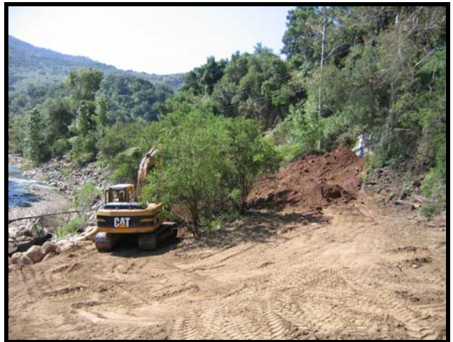
(left) Removing vegetation. (right) Clearing work area of vegetation