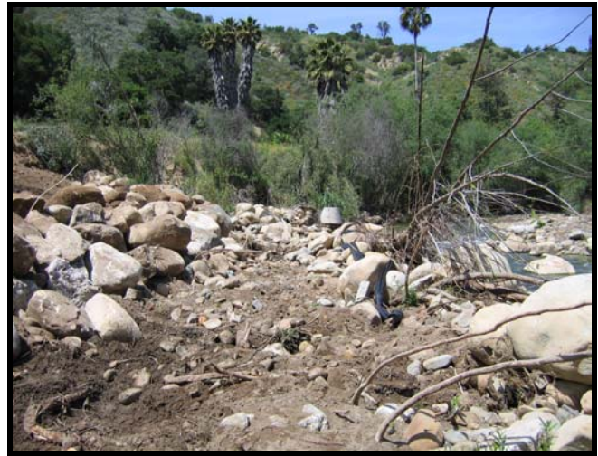
(left) Before: existing boulders onsite. (right) After: boulders removed to use for riprap.