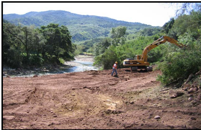
Leveling project site