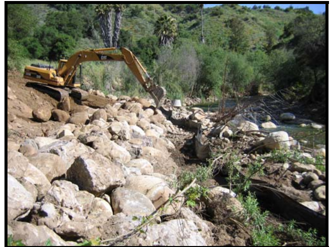
(left) Building riprap. (right) Building riprap.